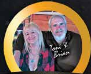
THUNDER ROADS NATIONAL FOUNDERS

THE LARGEST, FREE, NETWORKED MOTORCYCLE MAGAZINE IN THE WORLD!