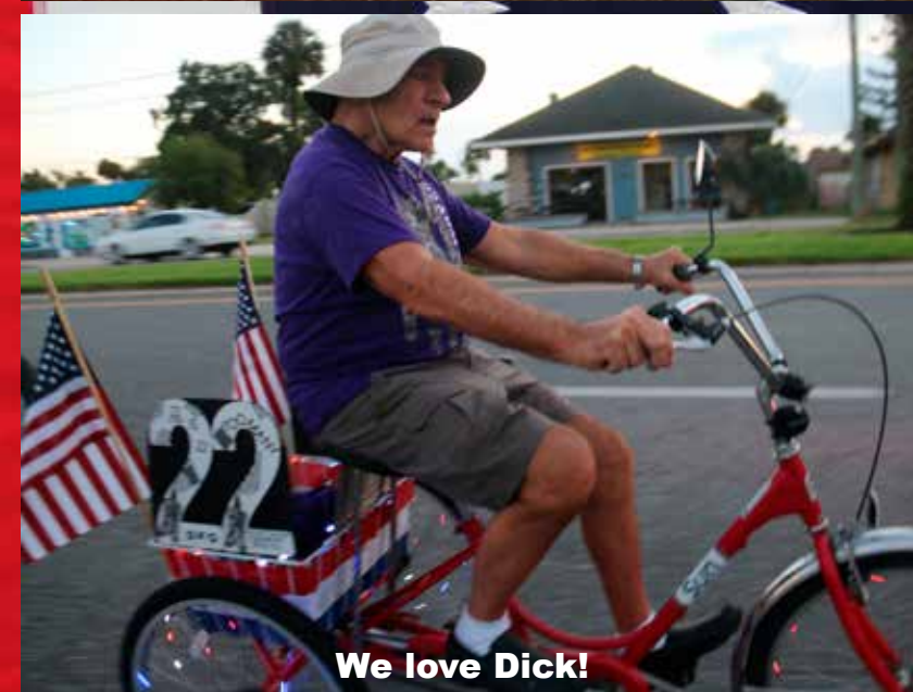
We love Dick!