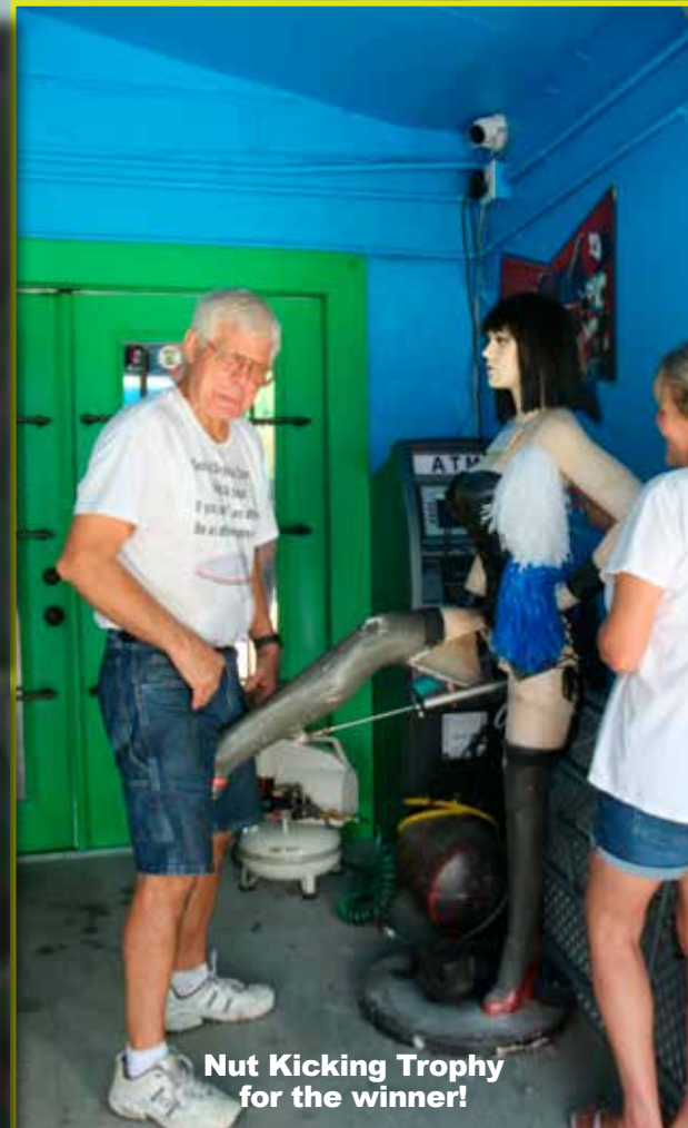
Nut Kicking Trophy for the winner!